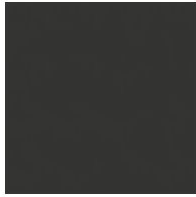
Painted metal Mat lead