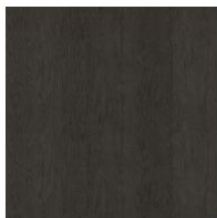
Veneered wood Coal ash