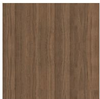
Veneered wood Walnut Canaletto