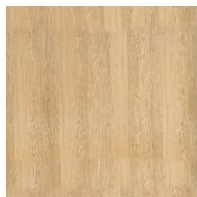
Veneered wood Natural ash

Materials, fabrics, leathers, colors and finishes are approximate and may slightly differ from actual ones. You can find the complete collection of Bonaldo fabrics and leathers on the website