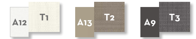
FOLDING TABLE 70X70 / CODE: QUETAV70