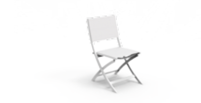
FOLDING CHAIR / CODE: QUESP