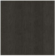
Solid wood Coal ash