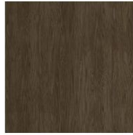
Solid wood Walnut painted ash