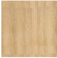
Solid wood Natural ash