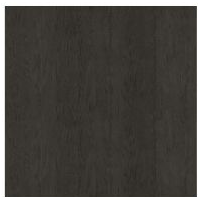
Veneered wood Coal ash

Materials, fabrics, leathers, colors and finishes are approximate and may slightly differ from actual ones. You can find the complete collection of Bonaldo fabrics and leathers on the website