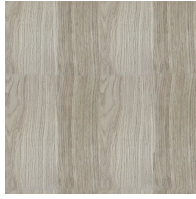
Solid wood Grey ash

Materials, fabrics, leathers, colors and finishes are approximate and may slightly differ from actual ones. You can find the complete collection of Bonaldo fabrics and leathers on the website