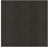
Solid wood Coal ash